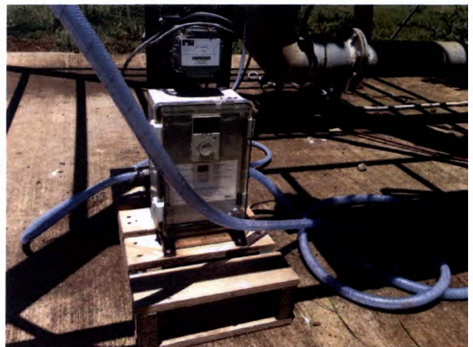
Photo 1: The Ecodose fertigation system, installed for the 2017 ryegrass season.

"We are now planning to install a fertigation unit on our second pivot, allowing us the flexibility to apply nitrogen fertiliser immediately after grazing and further reduce our labour costs."